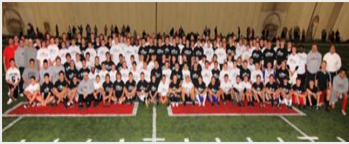
More than 150 Kickers, Punters & Snappers from 19 states attended the 5th Annual STS College Exposure Camp!