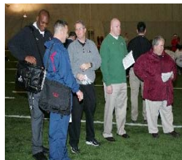
Numerous college coaches attended last year's camp. Hundreds more inquired about the top performers!