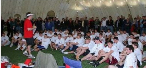
Recruiting, strength training and mental game seminars!