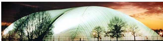
The Rutgers University Football Bubble provides perfect conditions!